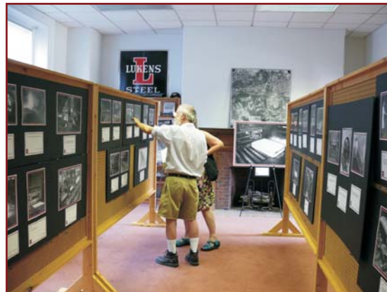
Visitors viewed the photo display during the Victorian Ice Cream Festival.

One of the main attractions at this year's Victorian Ice Cream Festival was the Lukens Steel Photo Exhibit of historic images from our collection. Over 100 never-before shown photos were displayed at both Graystone Mansion and the Lukens Executive Office Building. The images, mostly from between 1950 and 1990, document the People, Places and Products of the Lukens