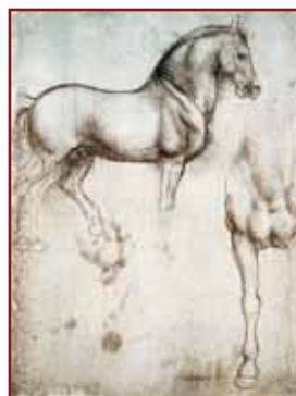
Original drawings by da Vinci.

da Vinci was commissioned in 1482 to create a massive pacing horse in bronze. After seventeen years perfecting his design he had managed to erect a full scale clay model of the horse, which unfortunately had to be abandoned when da Vinci fled his studio in 1499 and it slowly disintegrated.