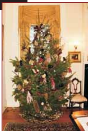
Decorated tree in Terracina.