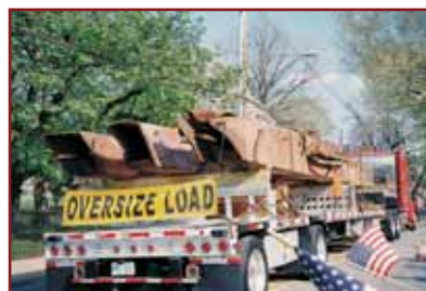
The World Trade Center Trees return to Coatesville.

We encourage everyone to send in your photos taken at our events — you may see them here!