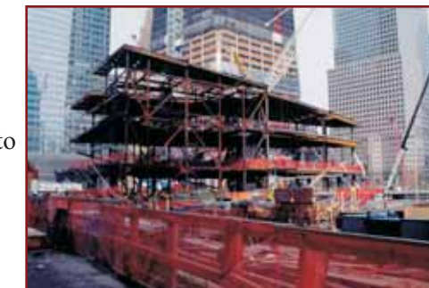
National 9/11 Museum under construction.