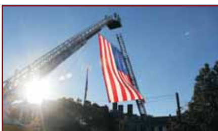
US flag at the September 11 Commemoration.