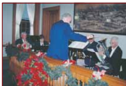
Lukens Band playing at the Holiday Open House in the Executive Building