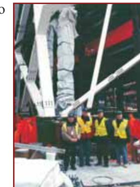
Group standing in front of still-wrapped WTC Tree.

The museum is still under construction, and in fact is being built around two of the trees from the World Trade Center which have already been erected in place (they were still wrapped for protection).