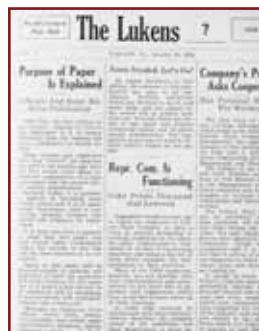
First issue of The Lukens Plate (later renamed Lukens Life )

The collections of the National Iron and Steel Heritage Museum will eventually contain many of the massive machines and products associated with a heavy industry like steel making. Equally important however, are the personal items that workers took into the mill with them. We are still seeking hard hats, boots, books and other personal items from current and former steelworkers or their families. If you would like to donate such an item to the Graystone Society please call at 610-384-9282.